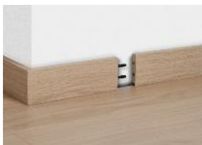
Connection of 2 skirting boards along the wall